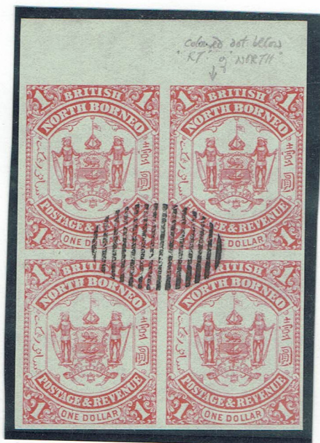
Lithographed : Blades, East & Blades Engraved : T. Macdonald