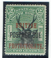
Mint copy of normal POSTAGE DUE in middle.