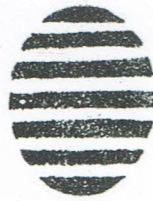
7 Bar cancel (type 2). Usage: 3.8.97 - 8.3.98