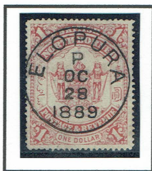
ELOPURA. 22.1.84 - 18.4.85