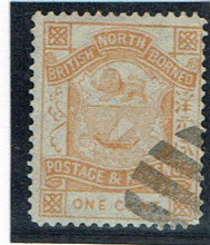
1892 1c orange.