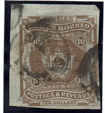
Rare used imperf SANDAKAN.