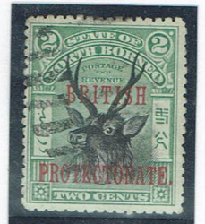
1901 Brit. Prot. 1c & 2c.