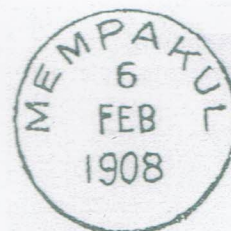
15.2.02 – 19.10.09