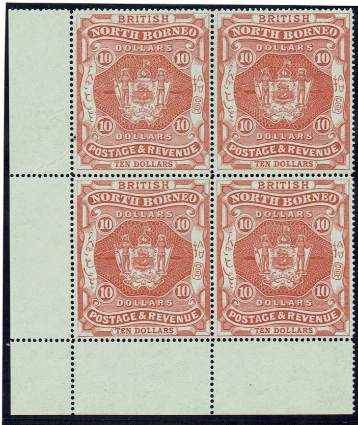
A scarce corner block colour trial in orange.

Lithographed : Blades, East & Blades Perforations : 14 and 12 across centre Engraved : T. Macdonald