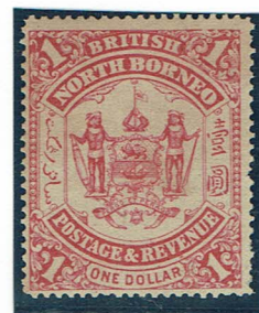
1894 issued $1