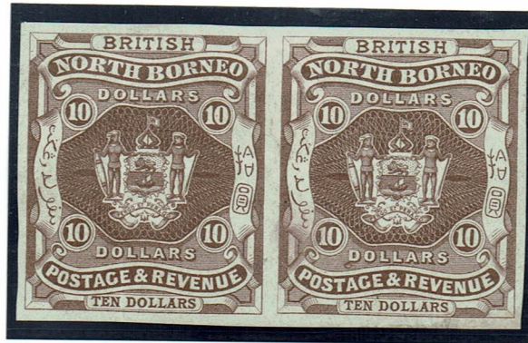
A scarce imperf pair.