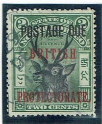
Used copy of scarce POSTAGE DUE at top.