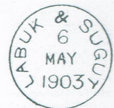
6.5.03 – 2.11.07