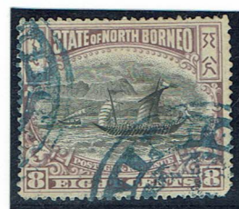
1894 8c black and dull purple.