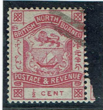
1889 1/2c magenta.

Mempakul was situated on the shore of the Kaleas River which flows into Brunei Bay opposite the island of Labuan.