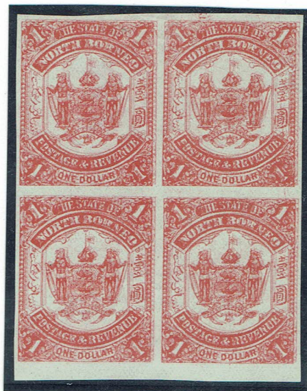
Imperf block but 'Printer's waste'.