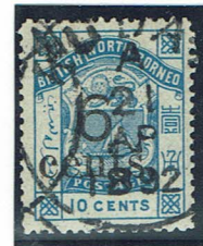
Pair with Sandakan 19 bars type K4.