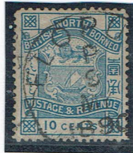
Scarce ELOPURA postmark.

This new set was ordered with the inscription 'POSTAGE & REVENUE' on all values.