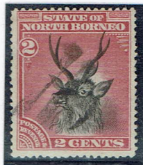
1894 1c. & 2c.