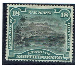
1894 issued 18c

The June 1895 provisionals were finally issued on the 1894 $1 only.