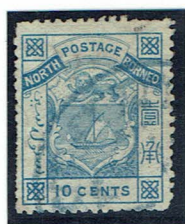
1886 1c blue