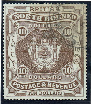
Used SANDAKAN squared chop.

Although available for postal use, their main usage was for revenue purposes.