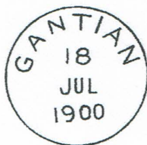
Type D2 18.1.00 – 8.8.00