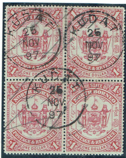
Scarce imperforate block of 4.