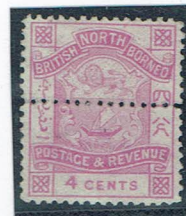
SPECIMEN set of three.

Lithographed: Blades, East & Blades Perforations: 14 using a single line machine. Engraved: Thomas. Macdonald