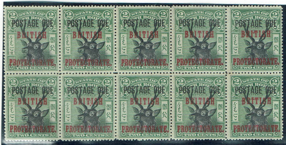
A block of the scarce 'POSTAGE DUE at top'.