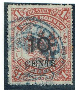
1895 10c provisional

This is possibly the largest block known like this.