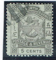
1889 5c grey.